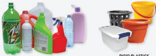
ALL PLASTIC BOTTLES

REDUCE FIRST, THEN REUSE, AND LASTLY RECYCLE. All items should be clean, dry, and loose (not bagged). Bottles should be rinsed out and emptied. Break down boxes. Empty aerosol cans. NO LIQUIDS - NO PLASTIC BAGS