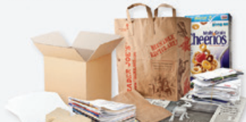
DRY PAPER & CARDBOARD