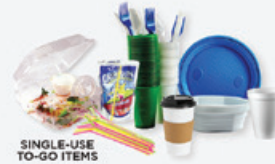
SINGLE-USE TO-GO ITEMS