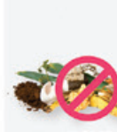
NO FOOD PUT THESE ITEMS IN THE TRASH INSTEAD