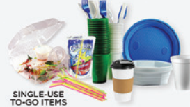
SINGLE-USE TO-GO ITEMS