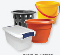
RIGID PLASTICS GREATER THAN 6"