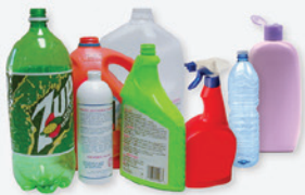
ALL PLASTIC BOTTLES

REDUCE FIRST, THEN REUSE, AND LASTLY RECYCLE. All items should be clean, dry, and loose (not bagged). Bottles should be rinsed out and emptied. Break down boxes. Empty aerosol cans. NO LIQUIDS - NO PLASTIC BAGS