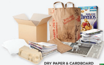
DRY PAPER & CARDBOARD