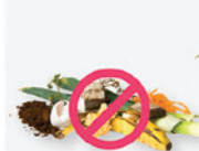
NO FOOD PUT THESE ITEMS IN THE TRASH INSTEAD